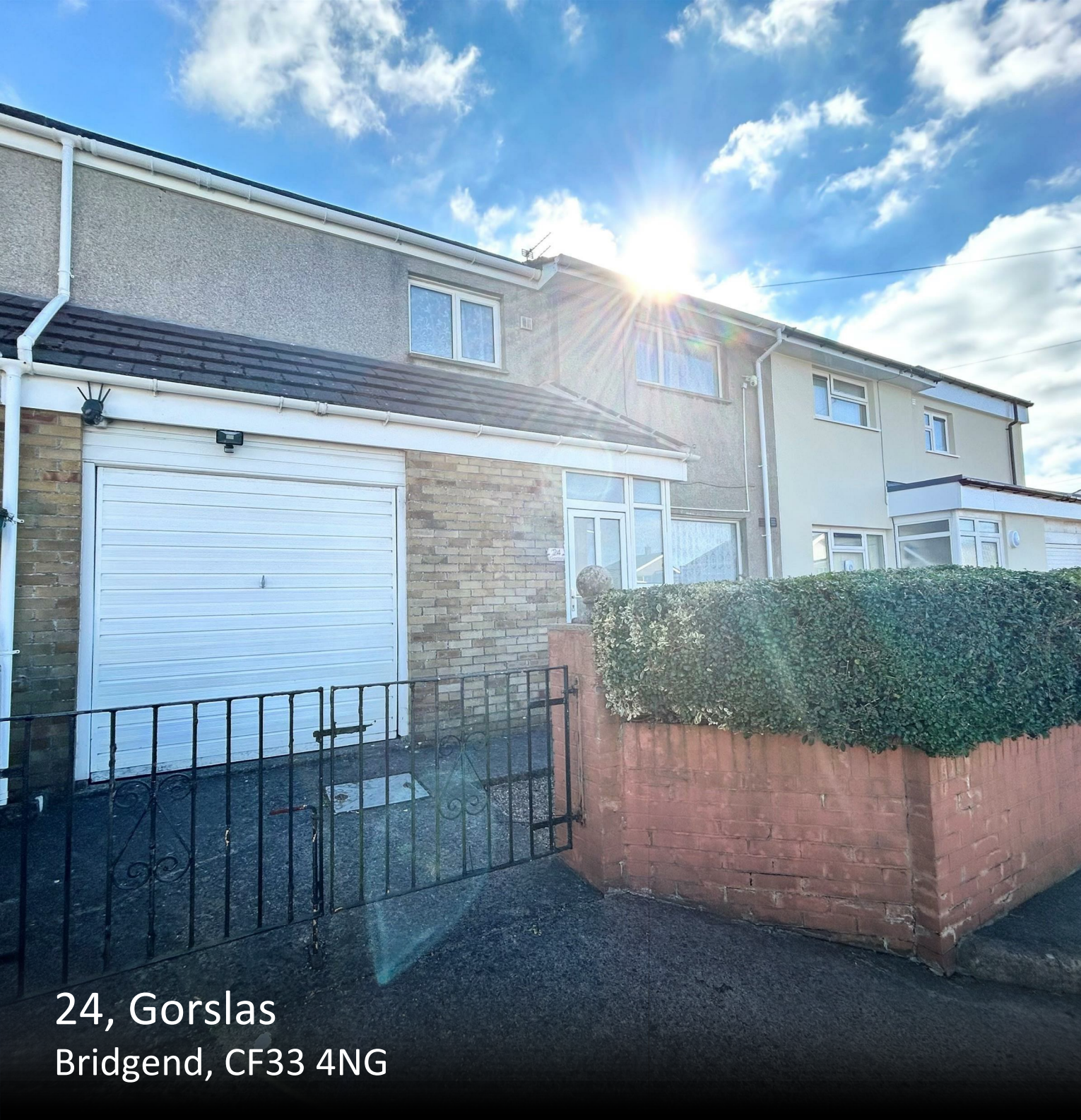
24, Gorslas Bridgend, CF33 4NG